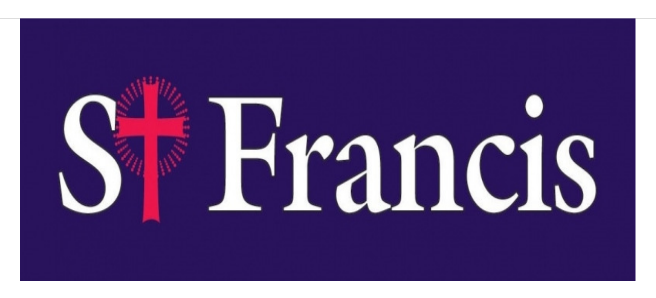
May 16, 2013

Is this email not displaying correctly? View it in your browser.