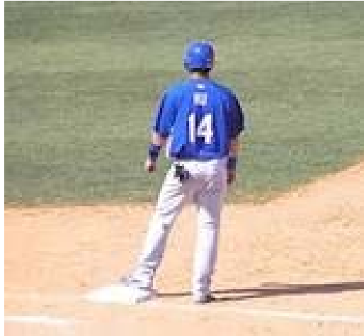
Hu's On First